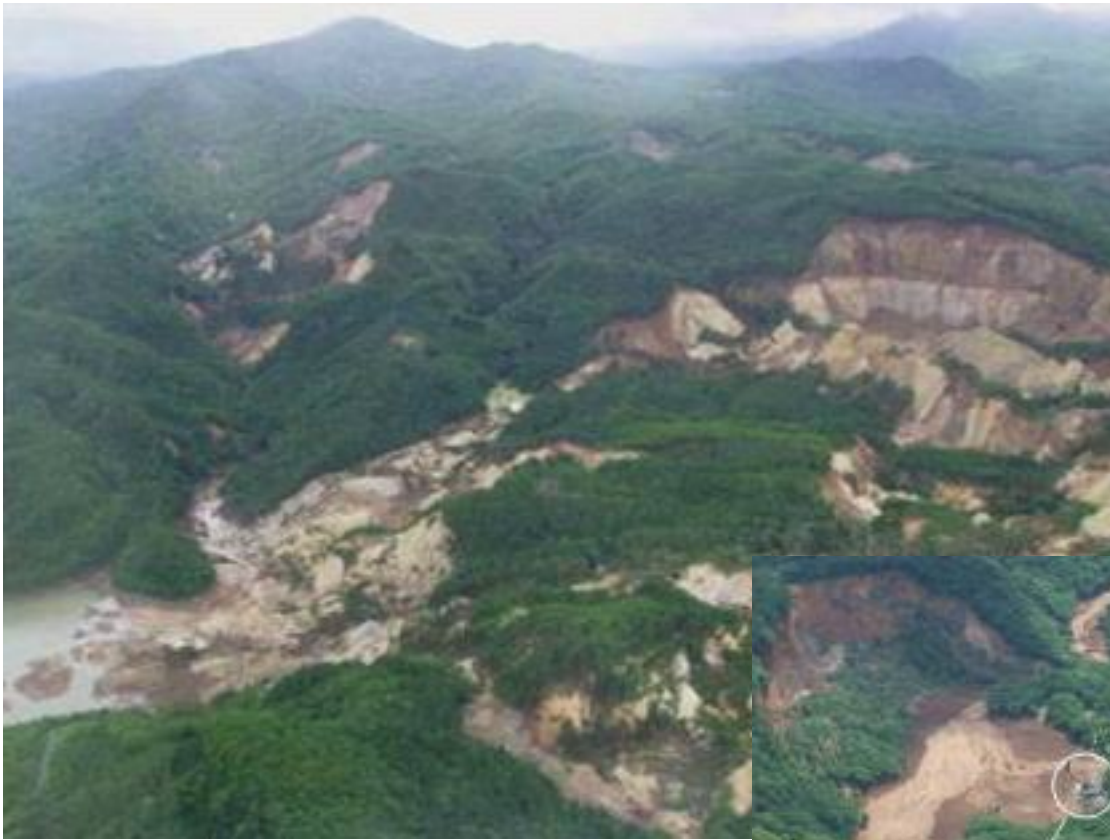
Landslide in upstream end of Aratozawa Dam reservoir (Kurihara City, Miyagi Prefecture)