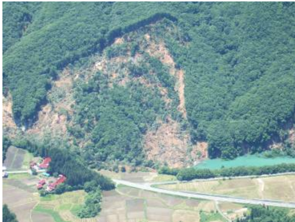
June 15 th