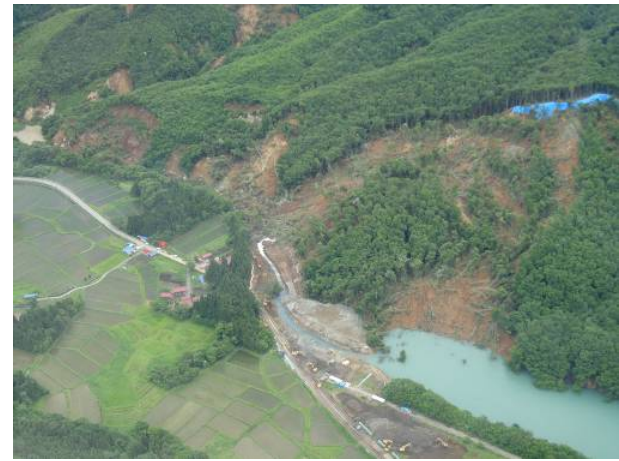
June 24 th