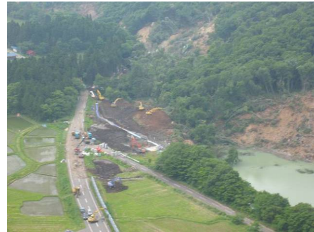
June 19 th