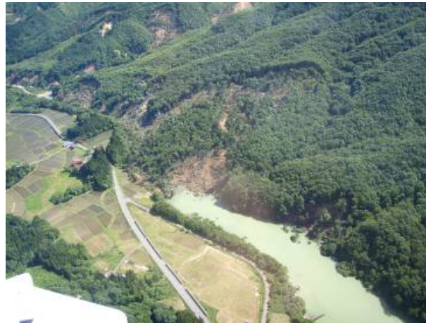
June 17 th