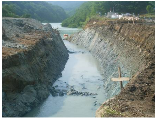
June 21 st