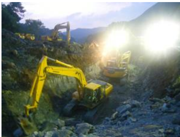
June 20 th